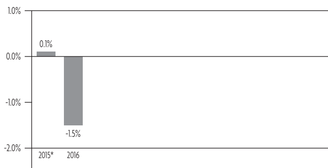
Series A Units – Annual return for the period ended December 31, 2016

The following bar chart shows the Fund's annual performance for the period shown. The chart shows, in percentage terms, how much an investment made on the first day of each financial year would have grown or decreased by the last day of each period.